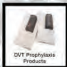
DVT Prophylaxis Products