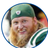
Nick Mangold , Former NFL and Pro Bowl Player